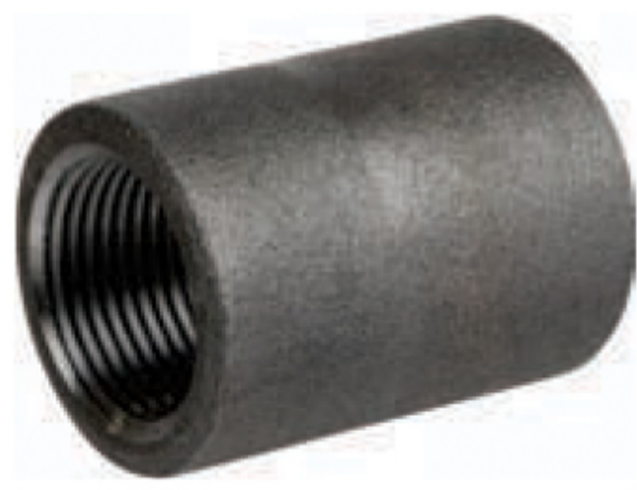
Fig. 42CP3 – Coupling